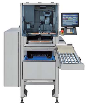
<WM-AI AS2 JR>

Specification subject to change without notice.